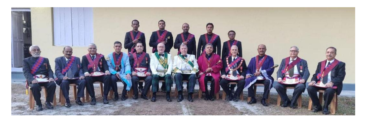
Chapter Camellia No 871

Another early breakfast before making our way to the Tea Museum where we spent a very interesting hour before making our way to the home of the Srishti Trust who are dedicated to the rehabilitation and generation of sustainable livelihoods for the differently abled children and young adults of the rural plantation community of Munnar, Kerala.