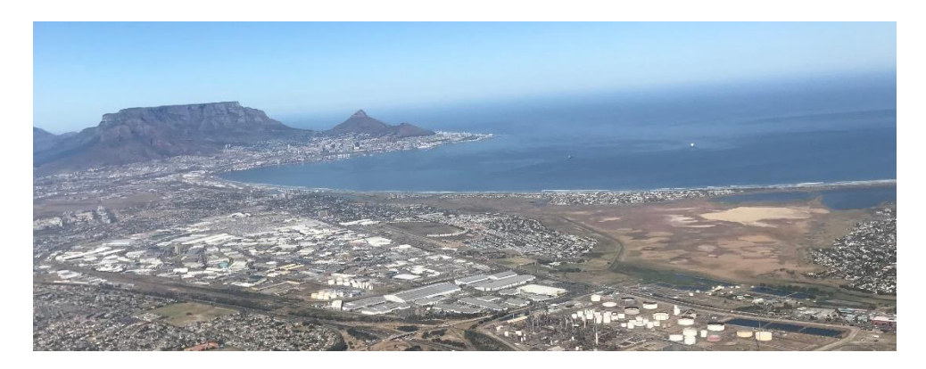
Flying into Cape Town – Table Mountain in the background

Grand Secretary made his way back to Edinburgh while I made for the Western Cape of Good Hope.