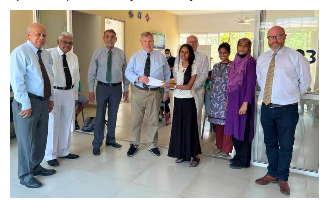
Presentation of a cheque to the staff at RCCI

Thursday morning started with a meeting with three of the senior Brethren in the new Superintendency. Thereafter we were taken to the RCCI (Rehabilitation Centre for the Communication Impaired) which was inspirational to say the least watching the staff working with the students.