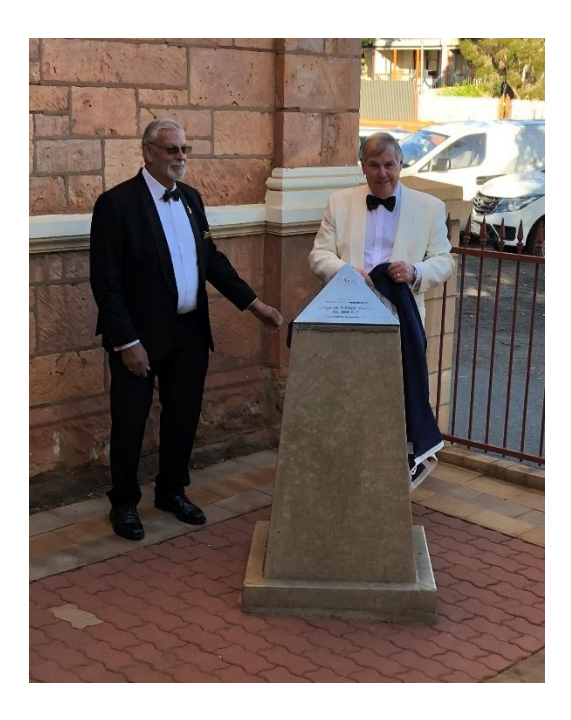
The unveiling of the Obelisk

That evening we attended a meeting of Lodge Sir William Wallace at which we witnessed a truly excellent MM Degree.