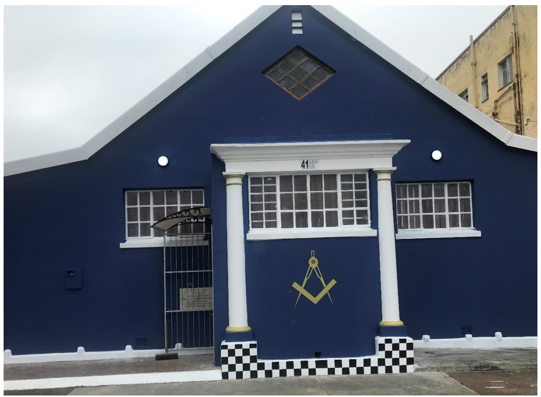
Lodge room in Port Elizabeth

The Lodge was full for the Ceremony after which we were joined by the ladies at the Banquet at the Thatchwoods Hospitality venue. A truly remarkable day enjoyed by all.