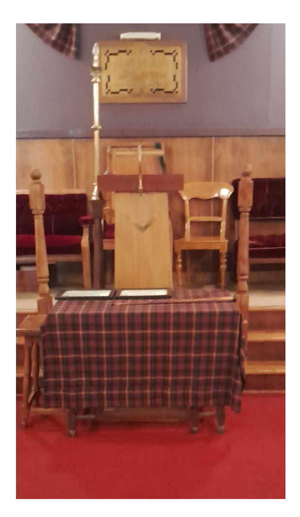
The new pedestal and pillars in the East