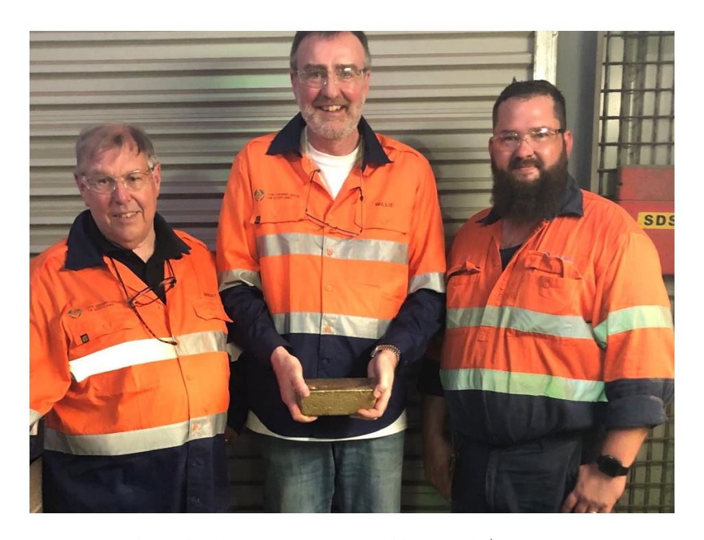
The end of the process – one gold bar worth $1.5 million

We were greatly privileged to be able to witness a "pour" resulting in two bars of gold being produced, each valued at $1.5 million.