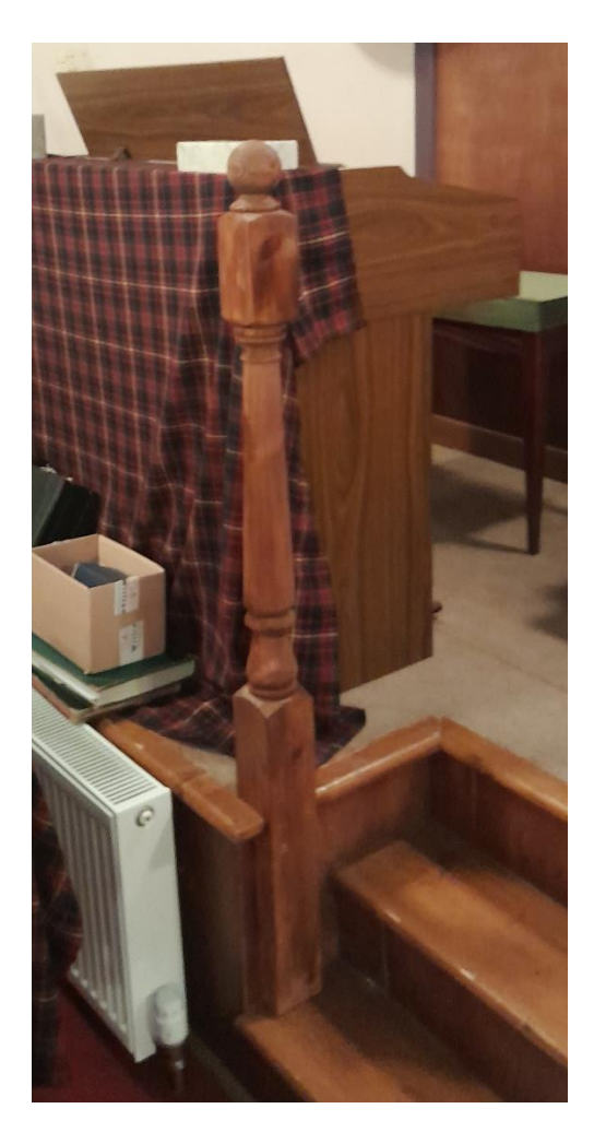
The new organ and one of the pillars