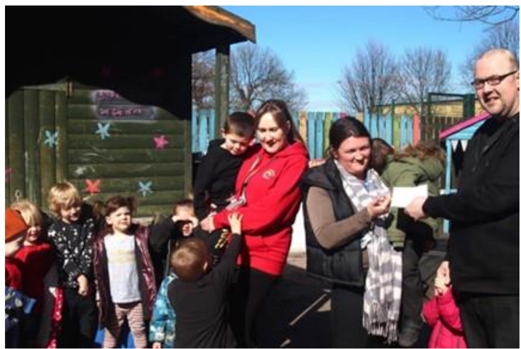
Donation to assist the Nursery at South Lodge School, Invergordon