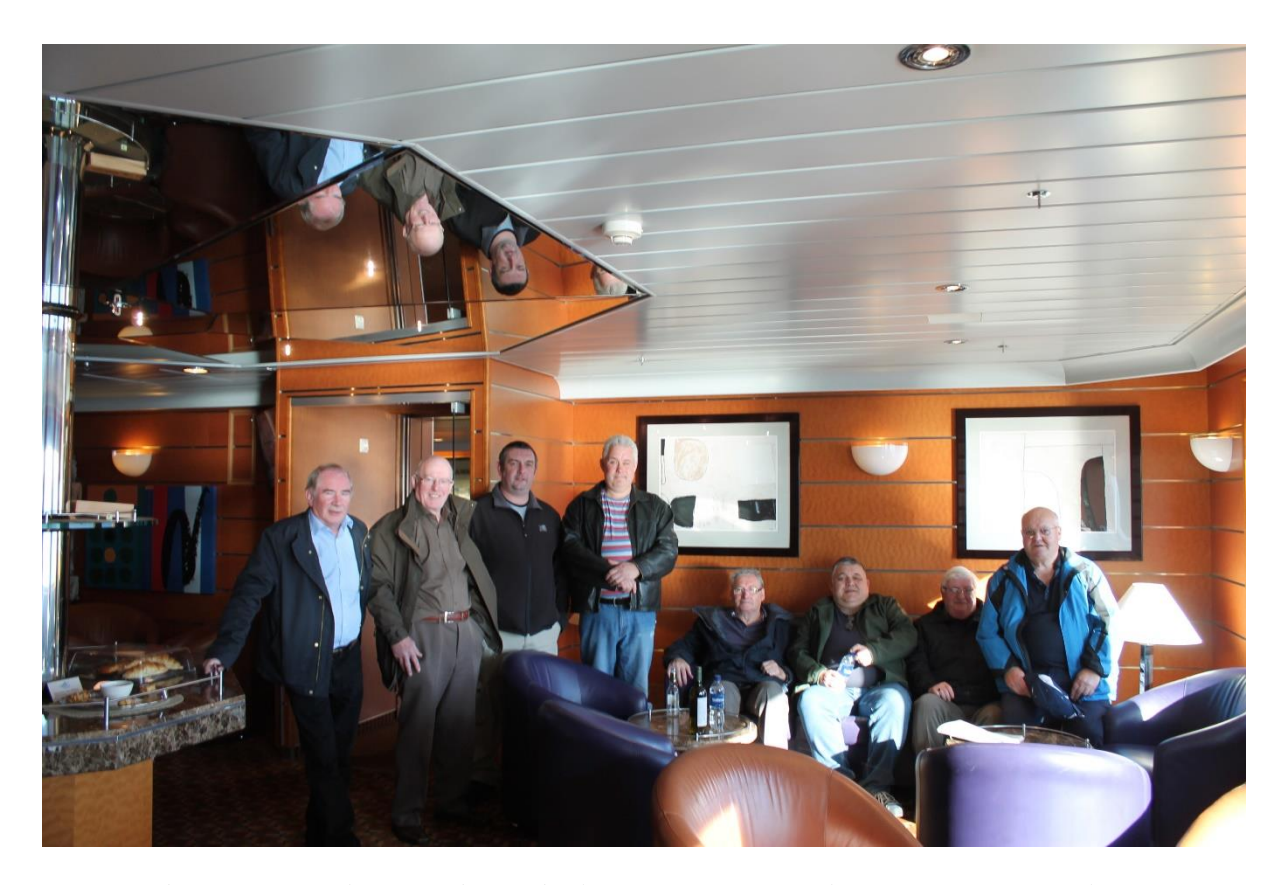
Picture of the Squaremen relaxing on the way back from a very successful trip to Stromness in Orkney on 1st October where they had 9 new Brithers join the Corporation.