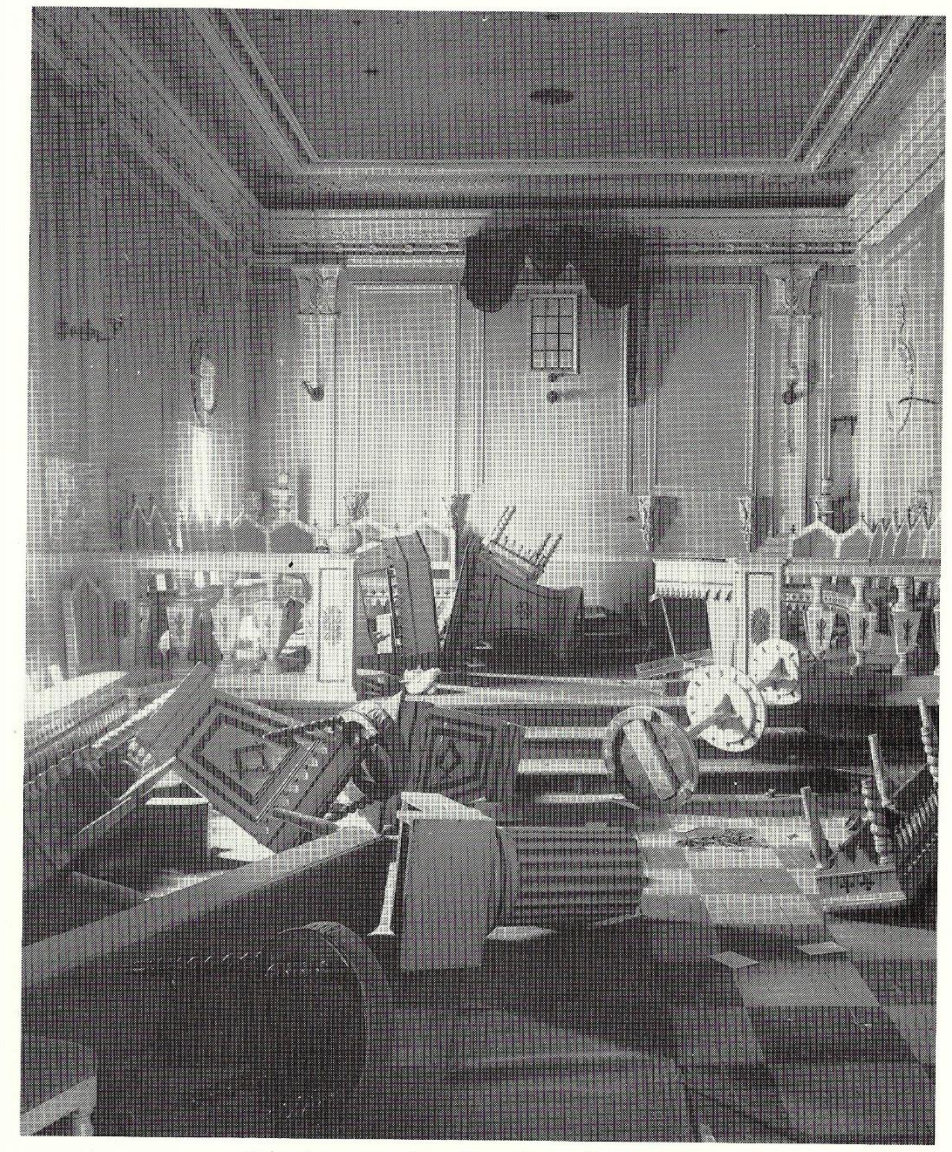
Temple maçonnique dévasté sous l'Occupation.

Peter also sent me a timely reminder that Freemason's also suffered at the hands of the Nazi occupation of France. The following picture depicts a French Lodge trashed by the Nazi occupation forces –