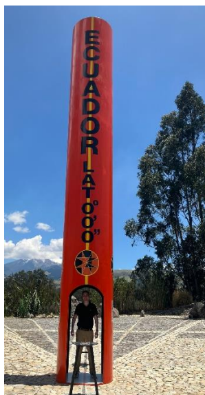
MEC Alan Buntain at the centre of the world.

On the Thursday morning, after breakfast, we were driven to a very interesting site right on the Equator – we were at latitude 0°. The guide was very good explaining the technicalities of the site.