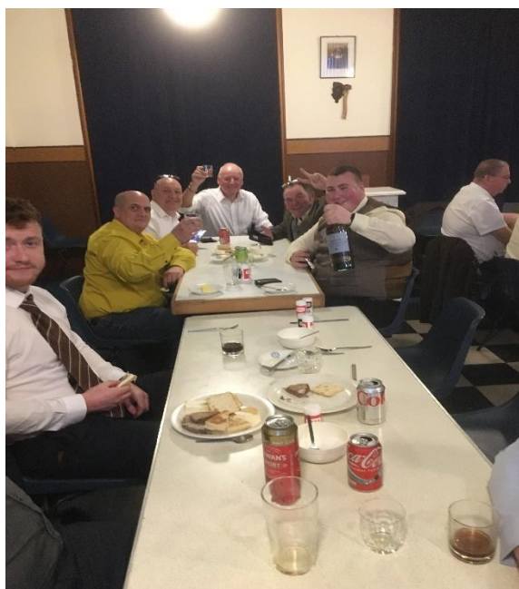
Court and visit

On 16 th November we are due to have a visit to Dundee and Angus Shed for a Grand Shed Deacons