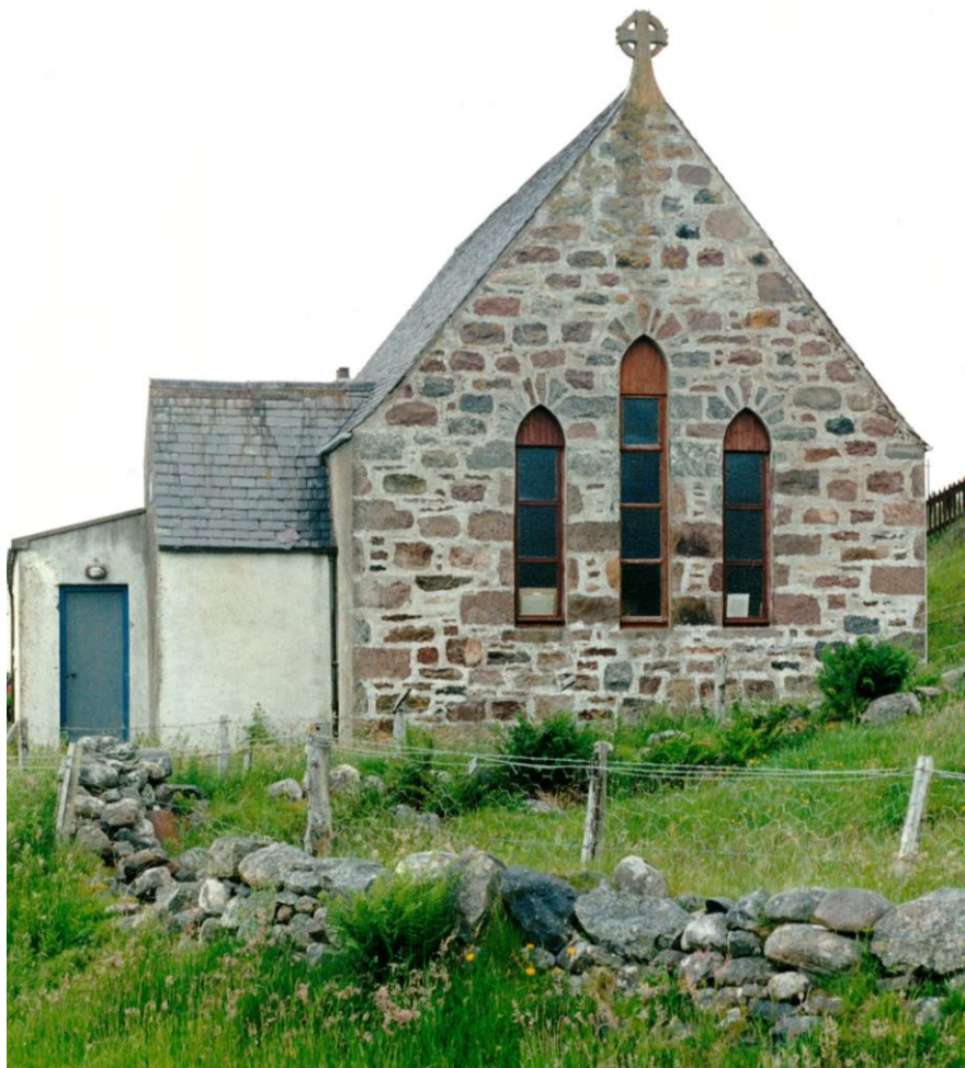
Lodges of the Province – Lodge Lochewe No 1551 - Aultbea

The Quarterly Newsletter of the Province of Ross and Cromarty