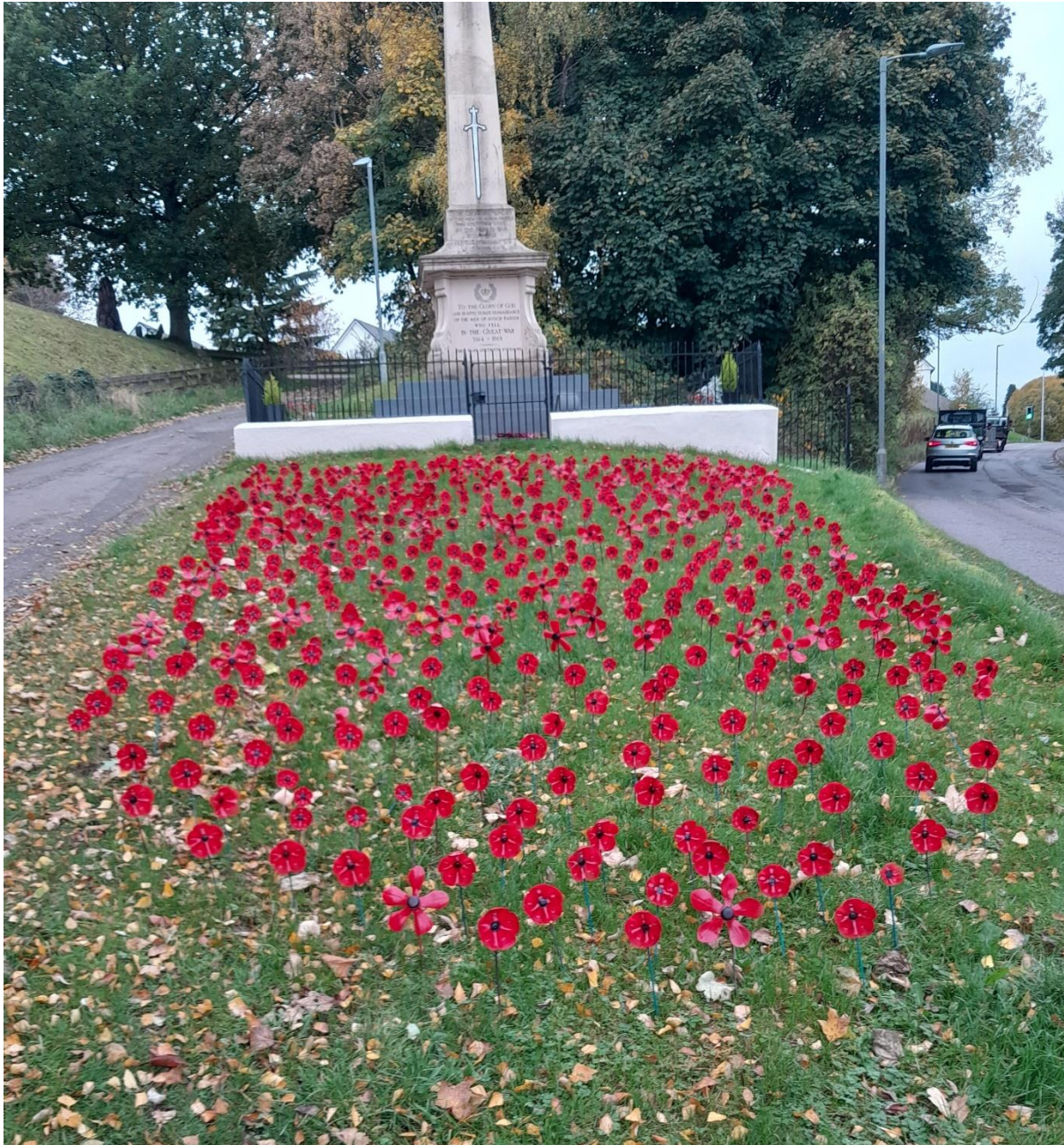
The magnificent display of poppies at Avoch War Memorial