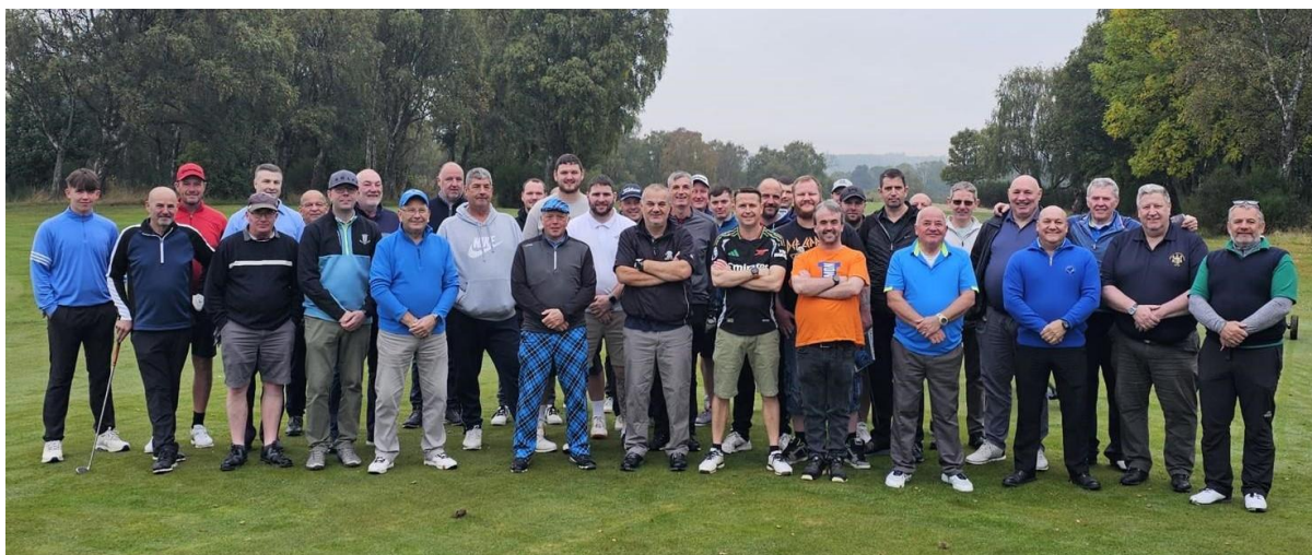
Above – Assembled brethren and guests ready for a shotgun start