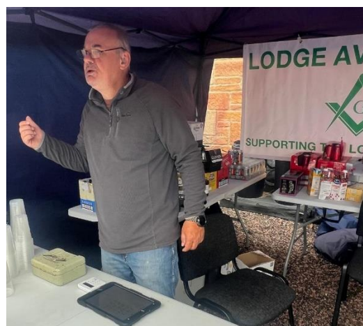
All doing a sterling job!