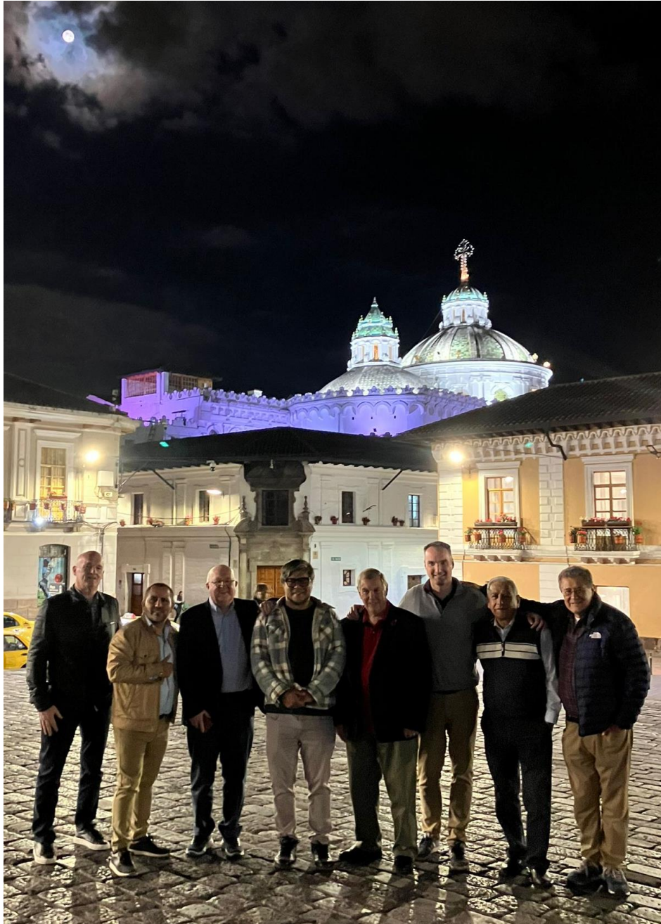
Quito by night