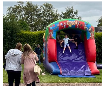
Left – the older generation enjoying themselves - Right – the younger generation having a ball.